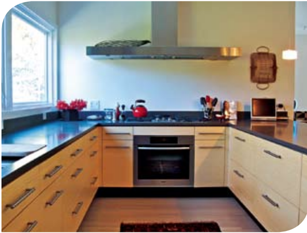
EcoUrban Aire EcoUrban Aire in clean and sophisticated quartered maple finish. All NAUF box and door construction. Top-tier, slow close door and drawer hardware with brushed stainless steel pulls. Indian Head Park, Illinois.

EcoUrban Collection is a new line of environmentally responsible, American-made, contemporary cabinetry for kitchen, bath and office.