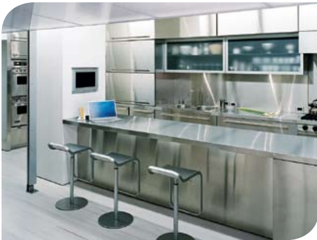
EcoUrban Steel Ultra modern custom sized EcoUrban Steel installation in Classic #4 Finish. All stainless box and door construction with premium tier hardware throughout. Sueded Finish stainless counter tops. New York, New York.